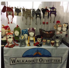
Walkabout outfitters LEXINGTON Here we are at the Richmond Raceway Complex all set up for Bizarre Bazaar! Lots of cute gift ideas for Christmas 🎁. We will be here this...